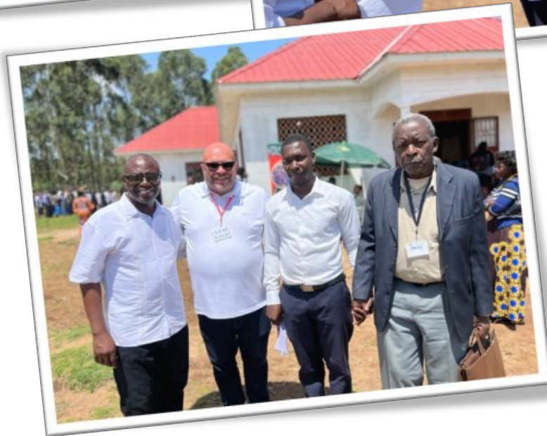
Uganda Christian Outreach Ministries U.C.O.M with World Outreach Ministries Foundation-W.O.M.F