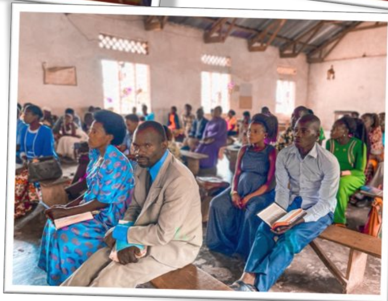
Uganda Christian Outreach Ministries U.C.O.M with World Outreach Ministries Foundation-W.O.M.F