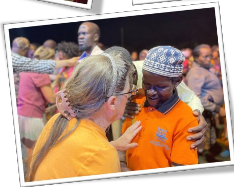
Uganda Christian Outreach Ministries U.C.O.M with World Outreach Ministries Foundation-W.O.M.F