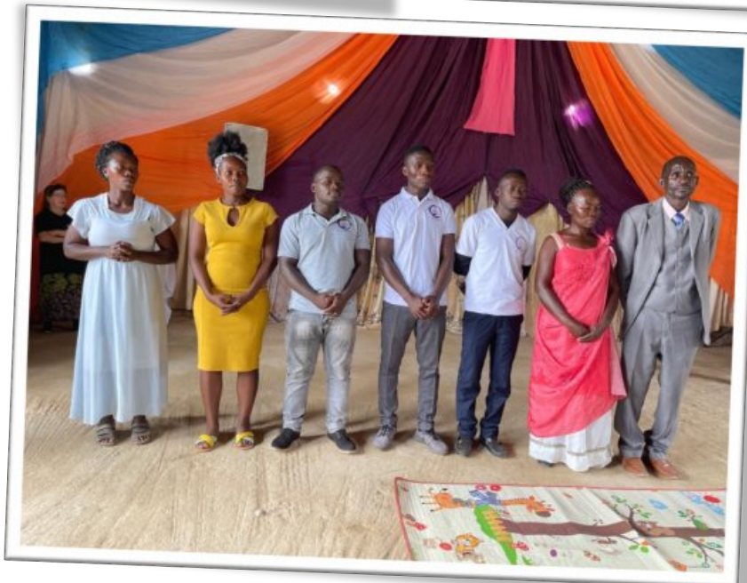
Uganda Christian Outreach Ministries U.C.O.M with World Outreach Ministries Foundation-W.O.M.F